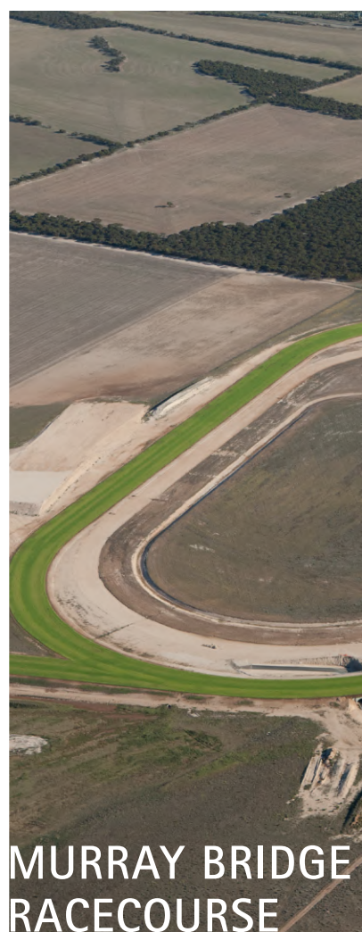
MURRAY BRIDGE RACECOURSE